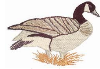
WL342 Canadian Goose 3.59 X 2.75 in. 91.19 X 69.85 mm 11,598 St. ⚙️