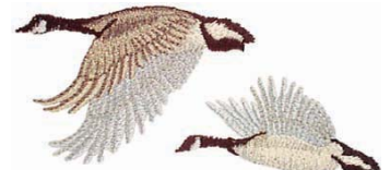
WL343 Canadian Geese 3.51 X 1.62 in. 89.15 X 41.15 mm 8,433 St.