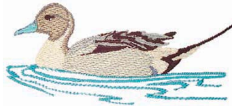
WL341 Pintail 3.51 X 1.52 in. 89.15 X 38.61 mm 4,921 St. ⚙️