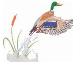
WL349 Mallard 3.38 X 3.01 in. 85.85 X 76.45 mm 9,721 St. ⚙️