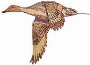
WL340 Pintail In Flight 3.89 X 2.76 in. 98.81 X 70.10 mm 8,746 St.