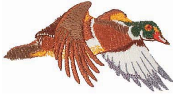
WL337 Flying Wood Duck 3.28 X 1.63 in. 83.31 X 41.40 mm 10,726 St.