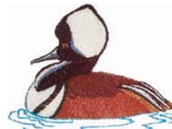
WL350 Hooded Merganser 3.61 X 3.35 in. 91.69 X 85.09 mm 10,583 St. ⚙️