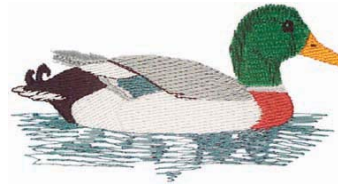
WL346 Mallard 3.77 X 1.93 in. 95.76 X 49.02 mm 4,426 St. ⚙️