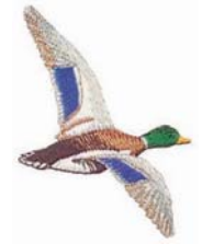
WL347 Incoming Mallard 1.99 X 3.36 in. 50.55 X 85.34 mm 5,592 St.