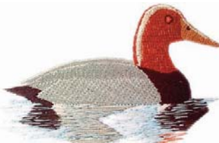
WL353 Canvas Back 3.71 X 2.51 in. 94.23 X 63.75 mm 4,433 St. ⚙️