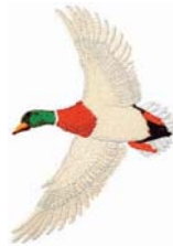
WL345 Mallard In Flight 3.11 X 3.50 in. 78.99 X 88.90 mm 11,719 St.