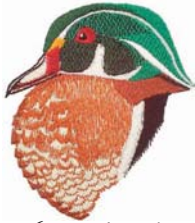
WL336 Wood Duck Head 3.05 X 3.51 in. 77.47 X 89.15 mm 12,370 St.