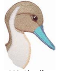
WL339 Pintail Head 2.98 X 3.47 in. 75.69 X 88.14 mm 9,675 St.