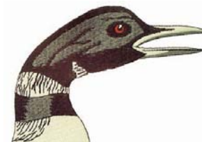
WL5088 Loon Head 5.13 X 3.91 in. 130.30 X 99.31 mm 10,019 St. L