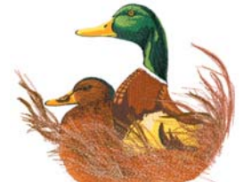
WL5102 Nesting Mallards 7.77 X 6.67 in. 197.36 X 169.42 mm 49,111 St. ⚙️ L

⚙️ Design contains a loose fill. ⚙️ Some white areas shown are not stitched.