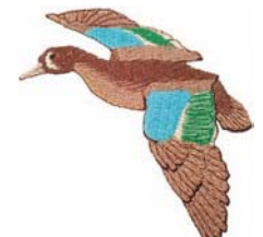
WL351 Blue Winged Teal 2.96 X 3.45 in. 75.18 X 87.63 mm 7,343 St.