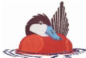
WL355 Ruddy Duck 3.51 X 2.58 in. 89.15 X 65.53 mm 7,921 St. ⚙️