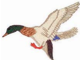
WL348 Splash Down 3.60 X 2.76 in. 91.44 X 70.10 mm 7,112 St.