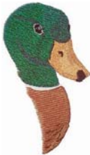
WL344 Mallard Head 2.25 X 3.67 in. 57.15 X 93.22 mm 8,809 St.