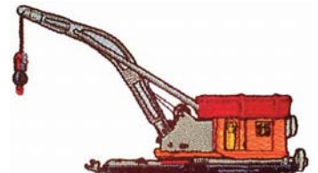
LT309 Railroad Derrick 3.54 X 2.20 in. 89.92 X 55.88 mm 9,502 St. ❄️

❄️ Design contains a loose fill. ❄️ Some white areas shown are not stitched.