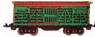
LT304 Cattle Car 3.68 X 1.34 in. 93.47 X 34.04 mm 9,959 St. S