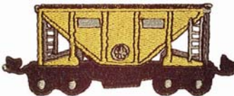
LT302 Hopper 3.54 X 1.40 in. 89.92 X 35.56 mm 10,156 St. ❄️ S