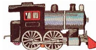
LT308 1910 Locomotive 3.66 X 1.85 in. 92.96 X 46.99 mm 13,727 St. ❄️