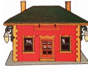
LT300 1930's City Station 3.50 X 2.58 in. 88.90 X 65.53 mm 14,354 St. ❄️