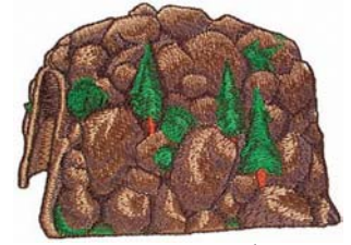
LT301 Tunnel 3.49 X 2.55 in. 88.65 X 64.77 mm 16,154 St.