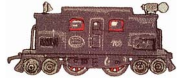
LT297 1915 Locomotive 3.76 X 1.68 in. 95.50 X 42.67 mm 10,827 St. ❄️