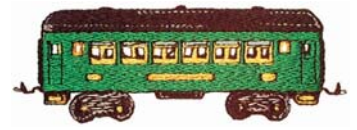
LT305 Passenger Car 3.43 X 1.19 in. 87.12 X 30.23 mm 8,167 St. ❄️ S