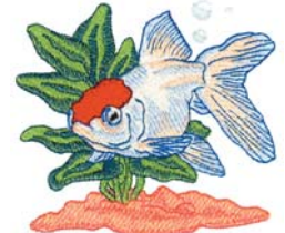
W0306 Red Cap Oranda 3.61 X 3.30 in. 91.69 X 83.82 mm 19,677 St. ⌘

⌘ Design contains a loose fill. ⊗ Some white areas shown are not stitched.