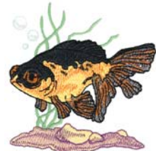
W0291 Calico Moor 3.71 X 3.89 in. 94.23 X 98.81 mm 15,213 St. ⌘