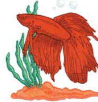
W0289 Siamese Fighting Fish 3.45 X 3.69 in. 87.63 X 93.73 mm 20,658 St. ⌘