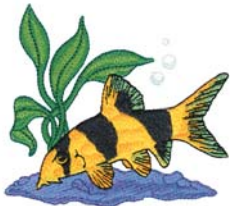
W0287 Clown Loach 3.89 X 3.55 in. 98.81 X 90.17 mm 18,904 St. ⌘