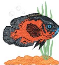
W0304 Oscar 3.34 X 3.89 in. 84.84 X 98.81 mm 14,471 St. ⌘