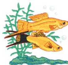
W0303 Swordtails 3.89 X 3.74 in. 98.81 X 95.00 mm 18,567 St. ⌘