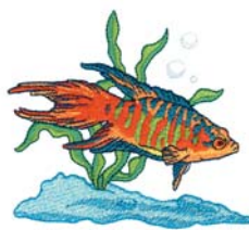
W0292 Paradise Fish 3.89 X 3.56 in. 98.81 X 90.42 mm 19,618 St. ⌘