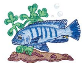
W0294 Peacock Cichlid 3.60 X 2.86 in. 91.44 X 72.64 mm 17,077 St. ⌘