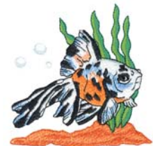
W0299 Fantail Goldfish 3.76 X 3.89 in. 95.50 X 98.81 mm 22,248 St. ⌘