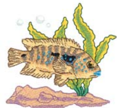
W0300 Jack Dempsey 3.89 X 3.60 in. 98.81 X 91.44 mm 19,755 St. ⌘