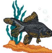
W0301 Black Moor 3.89 X 3.86 in. 98.81 X 98.04 mm 15,519 St. ⌘