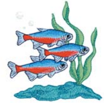
W0298 Cardinal Tetras 3.65 X 3.89 in. 92.71 X 98.81 mm 17,620 St. ⌘