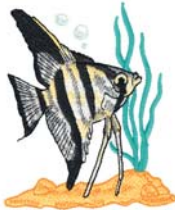
W0295 Angelfish 3.19 X 3.89 in. 81.03 X 98.81 mm 16,559 St. ⌘