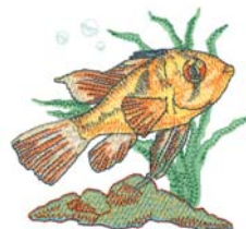
W0305 Dwarf Butterfly Cichlid 3.89 X 3.55 in. 98.81 X 90.17 mm 15,401 St. ⌘