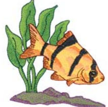
W0302 Tiger Barb 3.65 X 3.89 in. 92.71 X 98.81 mm 18,439 St. ⌘