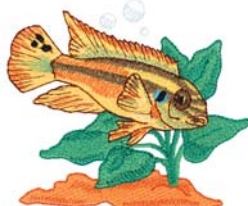
W0288 Kribensis 3.89 X 3.43 in. 98.81 X 87.12 mm 19,473 St. ⌘