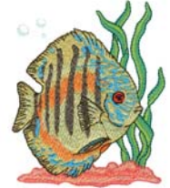
W0290 Discus 3.19 X 3.89 in. 81.03 X 98.81 mm 25,833 St. ⌘