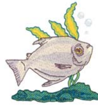
W0293 Silver Dollar 3.40 X 3.61 in. 86.36 X 91.69 mm 15,256 St. ⌘