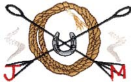
WS501 Branding Irons 3.01 X 1.88 in. 76.45 X 47.75 mm 7,168 St. ⚡⚡