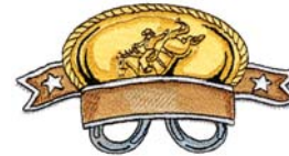
WS504 Belt Buckle 4.61 X 2.48 in. 117.09 X 62.99 mm 18,110 St. ⚡⚡