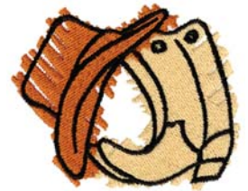
WS505 Boots & Hat 2.99 X 2.46 in. 75.95 X 62.48 mm 10,356 St. ⚡