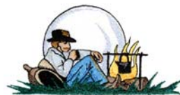
WS513 Campfire Cowboy 4.74 X 2.37 in. 120.40 X 60.20 mm 14,749 St. ⚡