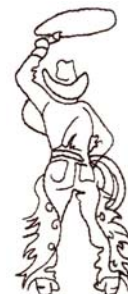
WS509 Lasso Cowboy 1.50 X 3.50 in. 38.10 X 88.90 mm 1,671 St. ⚡