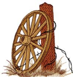
WS506 Wagon Wheel 3.35 X 3.51 in. 85.09 X 89.15 mm 14,262 St. ⚡⚡