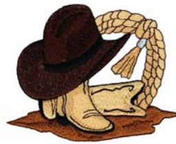
WS498 Boots & Hat 3.50 X 2.79 in. 88.90 X 70.87 mm 12,825 St. ⚡