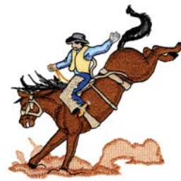
WS514 Bronco Rider 4.24 X 4.14 in. 107.70 X 105.16 mm 16,450 St. ⚡⚡