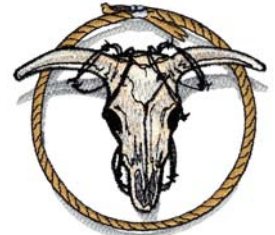
WS500 Skull 3.50 X 3.33 in. 88.90 X 84.58 mm 14,101 St. ⚡