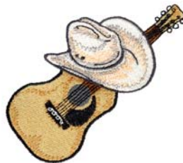
WS502 Hat & Guitar 3.50 X 3.19 in. 88.90 X 81.03 mm 11,623 St. ⚡