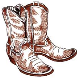
WS496 Cowboy Boots 3.50 X 3.46 in. 88.90 X 87.88 mm 7,270 St. ⚡⚡