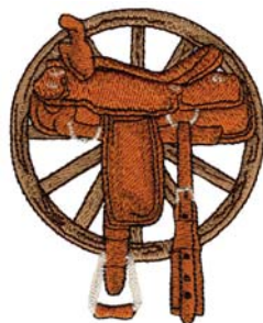
WS507 Saddle & Wagon Wheel 2.81 X 3.50 in. 71.37 X 88.90 mm 16,069 St. ⚡