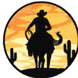
WS508 Riding into the Sunset 3.52 X 3.52 in. 89.41 X 89.41 mm 15,344 St.