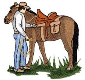
WS515 Cowboy w/ Horse 3.82 X 3.56 in. 97.03 X 90.42 mm 18,593 St. ⚡

⚡ Design contains a loose fill. ⚡ Some white areas shown are not stitched.