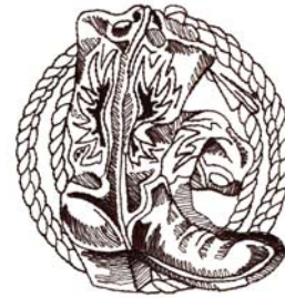
WS499 Boots & Lariat 3.34 X 3.50 in. 84.84 X 88.90 mm 7,073 St. ⚡⚡