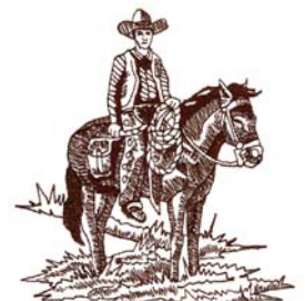
WS510 Old West Cowboy 4.23 X 4.75 in. 107.44 X 120.65 mm 11,272 St. ⚡⚡