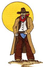
WS512 Cowboy In Duster 2.81 X 4.51 in. 71.37 X 114.55 mm 13,285 St. ⚡