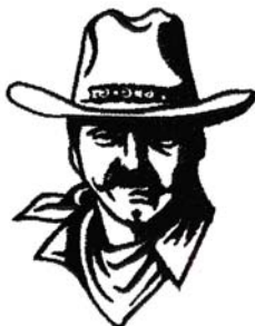
WS511 Cowboy 2.72 X 3.50 in. 69.09 X 88.90 mm 7,241 St. ⚡