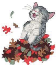
WP191_48 Jumping Into Leaves 3.89 X 4.51 in. 98.81 X 114.55 mm 22,539 St.