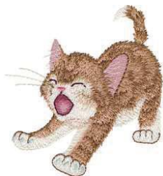
WP210_48 Yawn & Stretch 3.32 X 3.62 in. 84.33 X 91.95 mm 12,883 St.