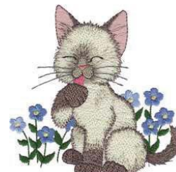
WP199_48 Bath Time 3.89 X 3.80 in. 98.81 X 96.52 mm 17,352 St. ◊