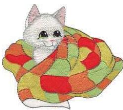
WP211_48 Quilt Kitty 4.56 X 3.89 in. 115.82 X 98.81 mm 20,847 St.