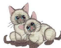
WP204_48 Siamese Twins 5.46 X 4.21 in. 138.68 X 106.93 mm 22,877 St. L