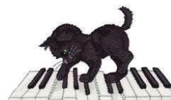
WP203_48 Piano Cat 5.50 X 3.18 in. 139.70 X 80.77 mm 19,016 St. ◊ L