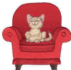
WP200_48 My Chair 3.89 X 3.74 in. 98.81 X 95.00 mm 17,374 St.