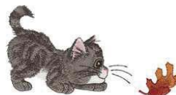
WP193_48 Chasing A Leaf 5.76 X 2.90 in. 146.30 X 73.66 mm 14,885 St. L