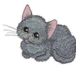
WP198_48 Kitty Loaf 3.26 X 2.56 in. 82.80 X 65.02 mm 9,965 St.