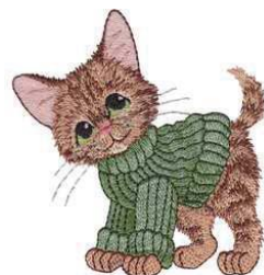
WP207_48 New Sweater 3.70 X 3.88 in. 93.98 X 98.55 mm 16,823 St. ◊