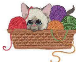
WP208_48 Hiding In the Yarn Basket 4.69 X 3.81 in. 119.13 X 96.77 mm 22,877 St. ◊