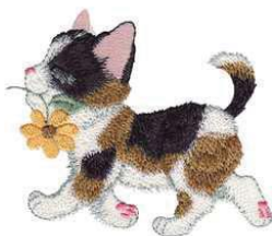
WP192_48 Calico With Flower 3.89 X 3.19 in. 98.81 X 81.03 mm 14,919 St.