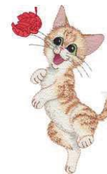
WP194_48 Playing With A Leaf 3.77 X 5.83 in. 95.76 X 148.08 mm 18,012 St. ◊ L