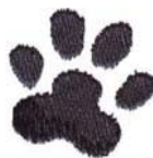
WP212_48 Paw Print 1.11 X 1.19 in. 28.19 X 30.23 mm 1,267 St. S