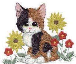
VP195_48 Calico & Flowers 3.89 X 3.31 in. 98.81 X 84.07 mm 17,590 St. ◊