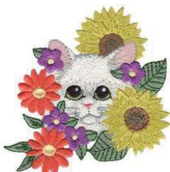
WP196_48 Peeking Out Of Flowers 3.82 X 3.89 in. 97.03 X 98.81 mm 19,918 St. ◊