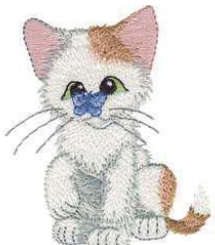
WP201_48 Butterfly Friend 3.00 X 3.62 in. 76.20 X 91.95 mm 12,728 St.