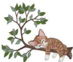
WP197_48 Napping In A Tree 5.10 X 4.25 in. 129.54 X 107.95 mm 17,976 St. ◊ L