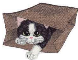
WP205_48 Cat In Bag 3.89 X 3.02 in. 98.81 X 76.71 mm 15,611 St.