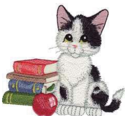
WP206_48 Teacher's Pet 3.89 X 3.52 in. 98.81 X 89.41 mm 17,824 St.