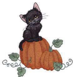
WP190_48 Pumpkin Kitty 4.56 X 4.75 in. 115.82 X 120.65 mm 17,914 St. ◊